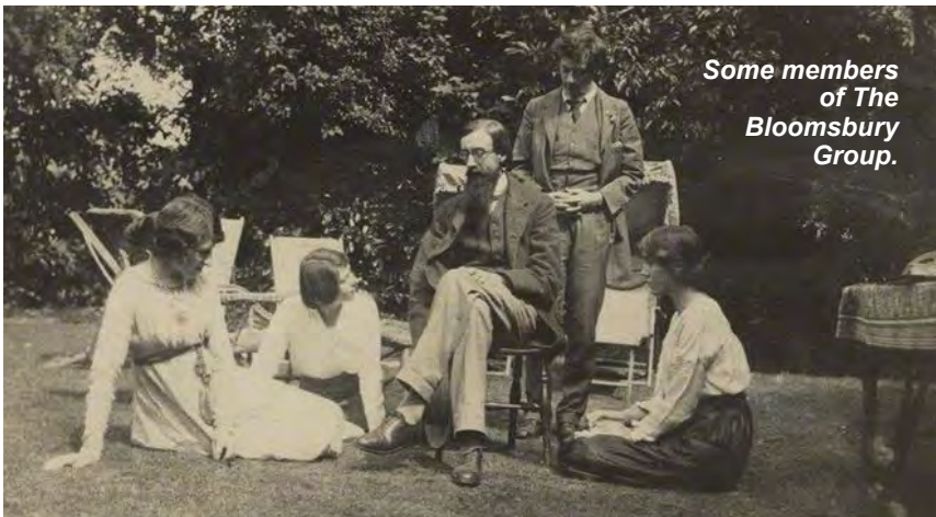
Some members of The Bloomsbury Group.